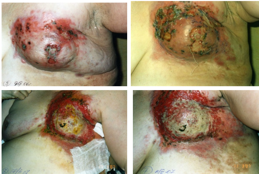
Stages of mammary gland cancer treatment by means of DST therapy.

Then fistulas appear and edema starts to fall. Then demarcation between healthy and cancerous tissues occurs. You should pay attention to a tumor which goes along the ribs. It will disappear afterwards. The skin starts, so to say, "boiling", but there is no temperature rise at that moment. Mammary gland tissues are also cool.