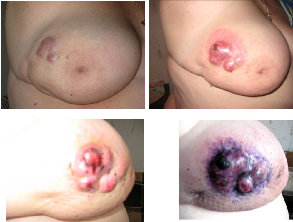
Patient D., 65 years old

Edema disappear completely and a process somewhat like necrosis, or better mummification, starts. After some "hesitation" blastoma starts to dry down, but at the same time protozoa and bacteria of all kinds populate all its surface and the gland thickness. I draw your attention to the "tumor". According to all parameters it should increase in size due to seeding. Though this doesn't occur. Metastases and reactive pleuritis do not occur as well, though they should take place according to the logics. At one moment sharp decrease of the gland volume occurs. It seems to "fall down" and demarcation line becomes more pronounced. Demarcation lines along the breast-bone and under the mummified breast are straight which also shows the existence of "geometry" in the organism. Edema disappears completely, and the process simultaneously looking like necrosis and mummification continues. Everything points to tumor reinvolution. In relation to the center, there remain round the tumor remnants: maceration, pigment spots and scaling. Due to tumor mummification all the population: commercials, saprophytes and parasites are not able to help the tumor progress. Later, only a scar and a small portion of healthy tissue remains oat the place of the mammary gland. I would like to remind you that no metastasis and relapses are observed with this kind of treatment. Here are similar examples.