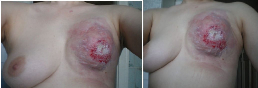
Patient 3., 45 years old