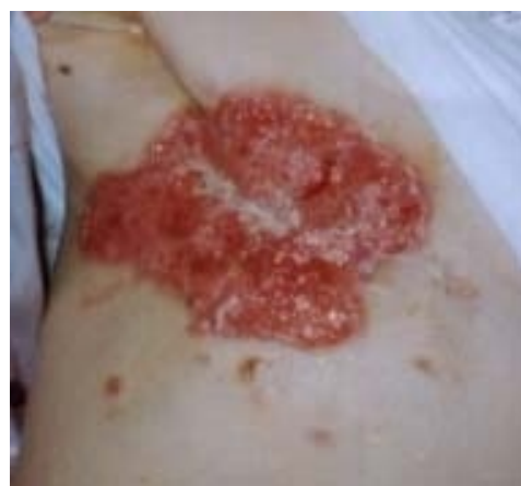
b) 3 months after the start of treatment

The first stages described above are absent at lower photographs.