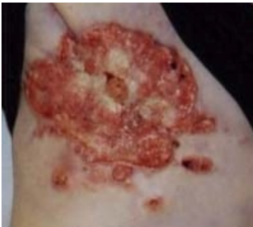
a) before treatment

I would like to draw your attention to the fact that if a patient addresses the doctor during the 1st or 2nd stage, then treatment is more effective and there is no mummification. In case of the 3rd and 4th stages and after chemotherapy, the mummification process is much more difficult and takes more time.